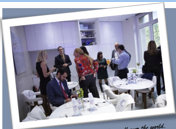
Our participants meet surgeons from all over the world, building a bigger professional network